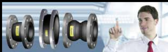
Rubber Joints are excluded from the Pressure Equipment Directive PED 2014/68/EU, according to its article 1.2(O).

We provide engineering application on installation and pipework layout upon request. Our support also includes general arrangement drawings, fluid compatibility tables, Operating and Maintenance Instructions and Certificates.